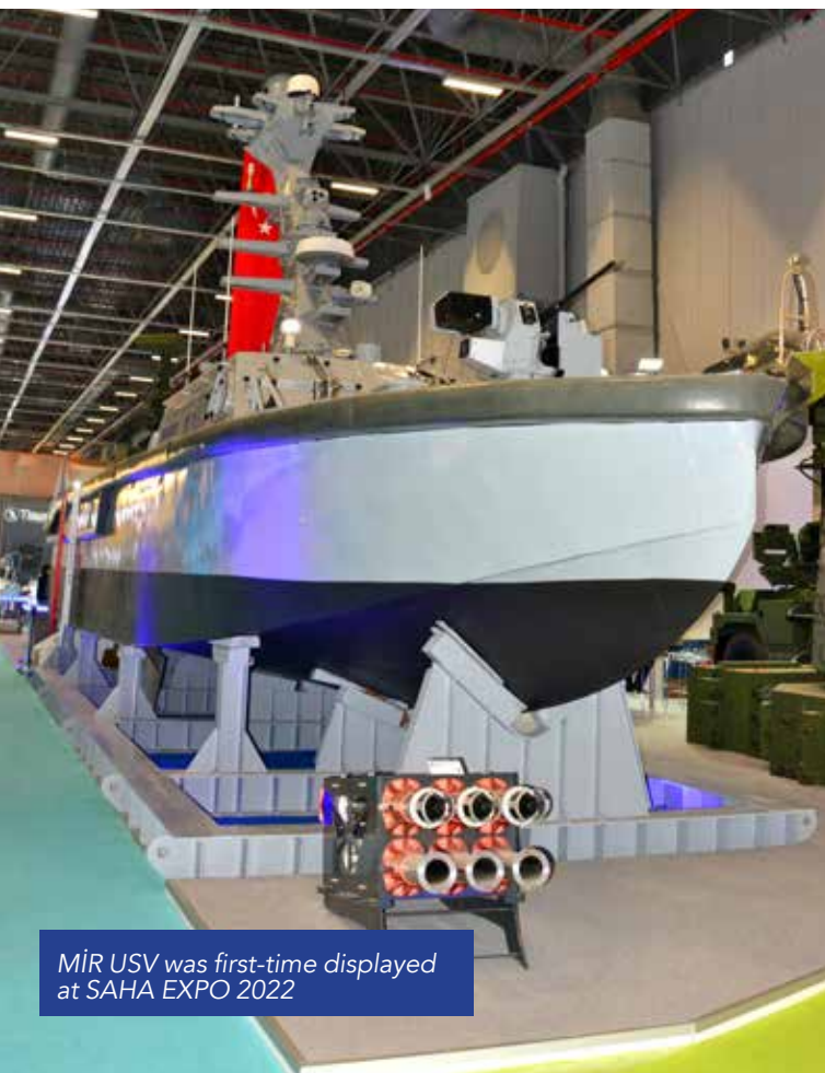
MİR USV was first-time displayed at SAHA EXPO 2022

The MİR/NB57 Autonomous and Swarm Capable Unmanned Anti-Submarine Warfare (ASW) Vehicle will be fitted with both ARAS-2023 Diver Detection Sonar, ORKUN-2053 Dipping Sonar, and Sonobuoy Launchers, and it will be ready for delivery by the end of 2022. ARMELSAN product ORKUN-2053 Dipping Sonar will be used in the towed configuration on the NB57/ MİR ASW USV built by SEFINE Shipyard. Just as the ASW Helicopter must hover while