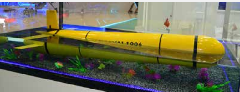
Technical Specifications of the Autonomous Underwater Glider NARVAL 1006

of traditional propellers or thrusters, is equipped with hydrofoils (underwater fins) that allow it to glide forward while descending into the water. NARVAL 1006 Underwater Glider, which can move by gliding in the water thanks to its hydrofoils, will be able to operate continuously for 6 months.