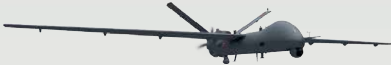
ANKA MULTIROLE UAV SYSTEM

SAHA EXPO SAHA EXPO DEFENCE & AEROSPACE EXHIBITION