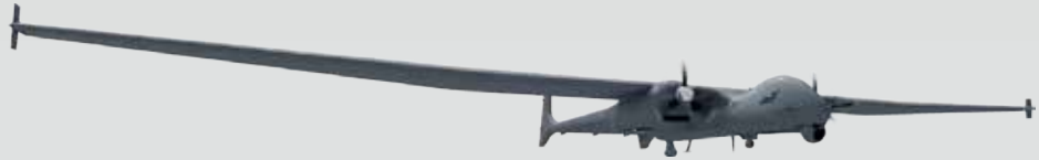
AKSUNGUR HIGH PAYLOAD CAPACITY UAV SYSTEM